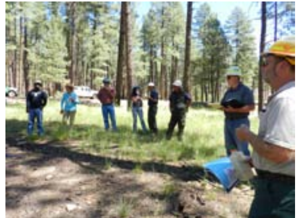
The Four Forest Restoration Initiative (4FRI) in Arizona consists of more than 30 stakeholders and includes forest supervisors and staff of the Coconino, Kaibab, Tonto, and Apache-Sitgreaves National Forests.

Of course, if a collaborative group does formally participate in the environmental analysis and review process (a.k.a. “the NEPA process”) by submitting comments on a collaboratively-developed project, it would have standing to participate in the objection resolution process as an Objector, provided it actually objects to the project. 5 36 C.F.R. § 218.5 . Collaborative groups that provide formal comments on a project do not need to have any “official” status under local, state, or federal law: they do not need to be a tax-exempt (Section 501(c)(3) in the United States tax code) organization, chartered under state law, governance agreements, or any other imprimatur of formality. Just as with any other community group that decides to gather together to work towards some cause, a collaborative group needs only to decide to work together and to self-identify as a particular collaborative. 36 C.F.R. § 218.2 (“Objector”).