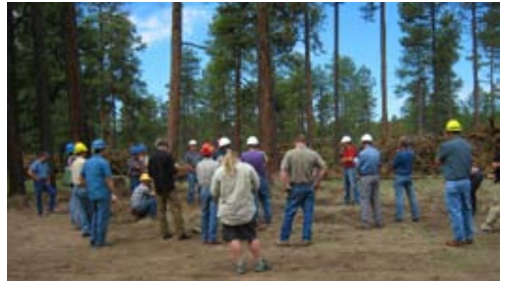
The 4FRI landscape spans 2.4 million acres and is the largest landscape-scale restoration project selected by the CFLR Program. The Final EIS and Draft ROD for the first phase of the project was released in November 2014.