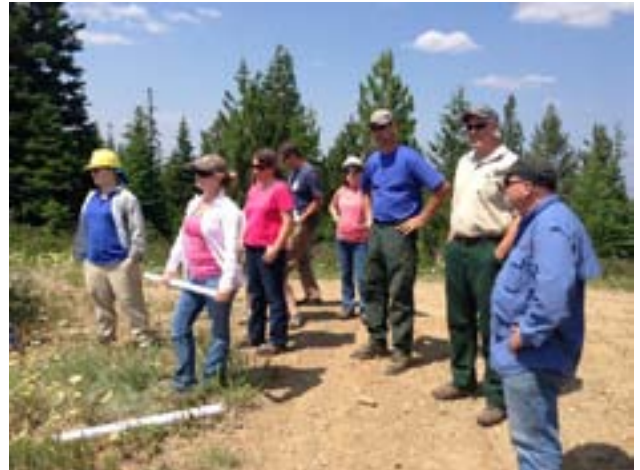
Blue Mountains Forest Partners is a diverse group of stakeholders in eastern Oregon who collaborate to improve the resilience and well-being of forests and communities in the Blue Mountains.

Given that collaborative groups generally support the restoration project at issue in litigation, such parties would be intervening on behalf of the Forest Service, making the collaborative group a Defendant-Intervenor. As such, the collaborative group would essentially step into the shoes of the Forest Service, and offer rebuttal arguments as to why the project complies with the law and should be implemented. In particular, the collaborative group would offer arguments that specifically implicate the interests of the collaborative group, for example, about the important benefits to wildlife, fire risk reduction, community well-being, and social agreement conferred by the project. These interests are unique to the collaborative group: while also important to the Forest Service, they affect members of the collaborative — and the collaborative process more generally — differently than they affect a federal agency.